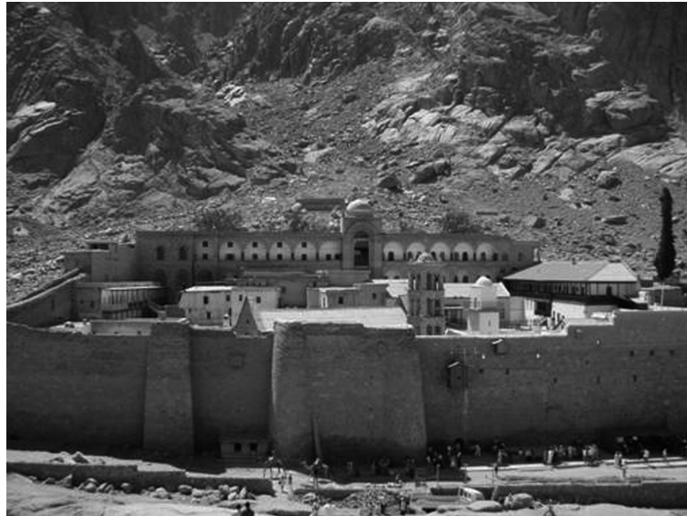
Fig. 4 for Question 4

St. Catherine's Monastery is an Orthodox monastery on the Sinai peninsula at the base of Mount Sinai in Egypt. One of the oldest Christian monasteries in the world, St. Catherine's includes the burning bush seen by Moses and contains many valuable religious icons. This area is sacred to three world religions: Christianity, Islam and Judaism.